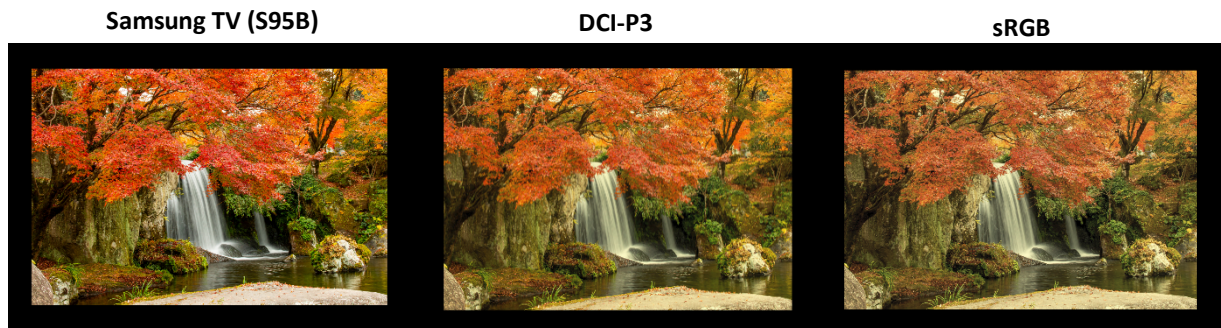
Figure 1. RGB Rendering of a natural scene across three different color gamuts

The findings will benefit both panel design and manufacturing as well as display standardization.