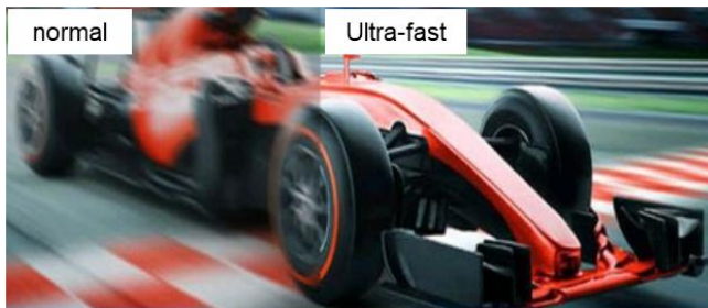
Figure 3. The principle by which a polarizer controls light transmission.

This paper uses a high-precision and high-contrast polarizer, which can effectively separate and block un-polarized light, so that the display can better absorb ambient light when displaying black images, thereby improving contrast ratio.