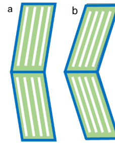
Figure 1. The difference between ITO 7° (a) and 15° (b).

For response speed improvement, panel design plays a particularly important role in addition to material optimization. Based on CSOT's extensive panel design experience, we creatively designed ITO's slit to be 15 degrees, which increases the alignment Angle compared to normal gaming monitor design, greatly speeding up the response speed of the LCD. Meanwhile, the channel material of the TFT device uses Indium Gallium Zinc Oxide (IGZO, a semiconductor material), which possesses higher electron mobility compared with the traditional \alpha -Si material, and makes the designed TFT device a higher charging rate so that can drive the liquid crystal's rotation efficiently and quickly.